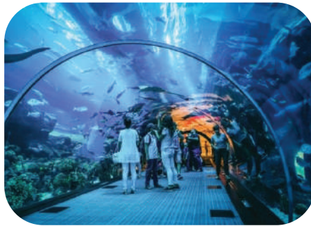
Dubai Aquarium & Underwater Zoo